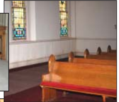
Chapel work in progress