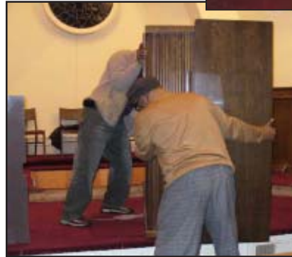
removing the organ

home. The carpet has been removed in the sanctuary and the old pine floors are now visible.