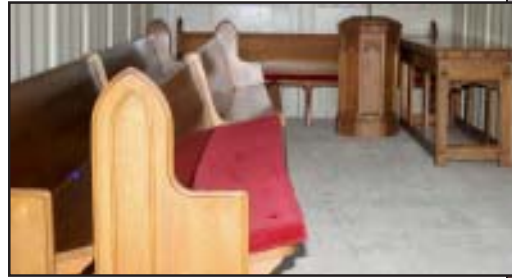
storing the furniture

One worship service Sunday, January 10, 2010 10:30 a.m. Worship, with Ordination and Installation of Elders 9:30 a.m., Sunday School Chili cookoff covered dish luncheon to follow worship