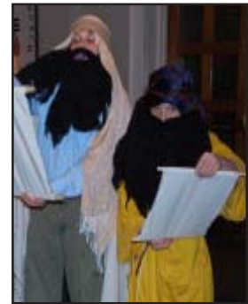
Prophets tell the story

The Junior Girl Scouts in Troop 1460, sponsored by Sharon Presbyterian Church, are currently working on their bronze award project. As a way to say thank you to Sharon Church for sponsoring the troop, the girls decided their project would be to make improvements in the children's library at the church. To kick off the project, the girls are requesting donations of new or gently used children's books to add to the books already in the library. Please look for the collection box located near the elder boxes in the hallway of the Worship Building.