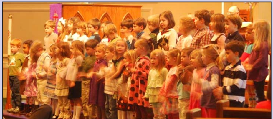
WDS children singing for March 4 Lenten Service