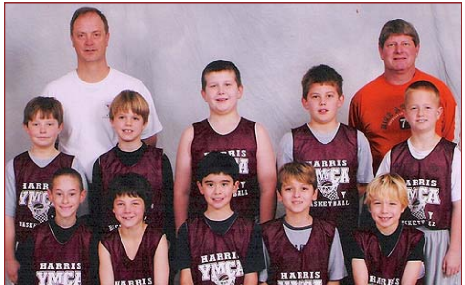
The Sharon Presbyterian Church Boys U-10 Basketball Team at the Harris Y went undefeated 8-0 for the season!