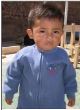
The children of Huanta are wonderful!

Seventeen (17) people have committed to participate in this year's trip. Last year, twelve (12) suitcases of children's clothing and Spanish Bibles and office supplies for the Presbytery's Biblical Institute and its students were donated by members of Sharon Presbyterian Church.