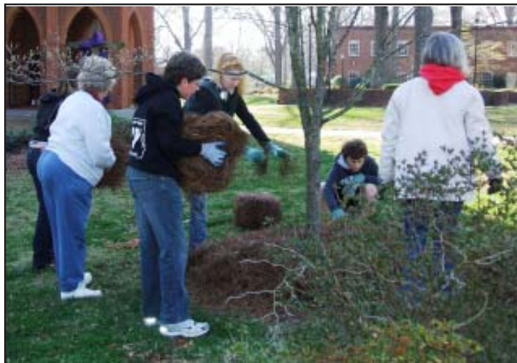
As one of their service projects the Confirmation Class and mentors spent a chilly Saturday in March helping with landscaping around the church campus.

The Middle School SPY wrapped up its year with ice skating, pizza, a movie, and lock-in at the church on May 15. Nineteen youth enjoyed the fun and fellowship. Special thanks are extended to all who helped with the event and throughout the year. We will begin meeting again in the fall and invite all middle schoolers to join the fun.